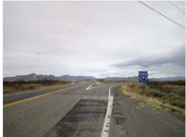
I-10 & 191