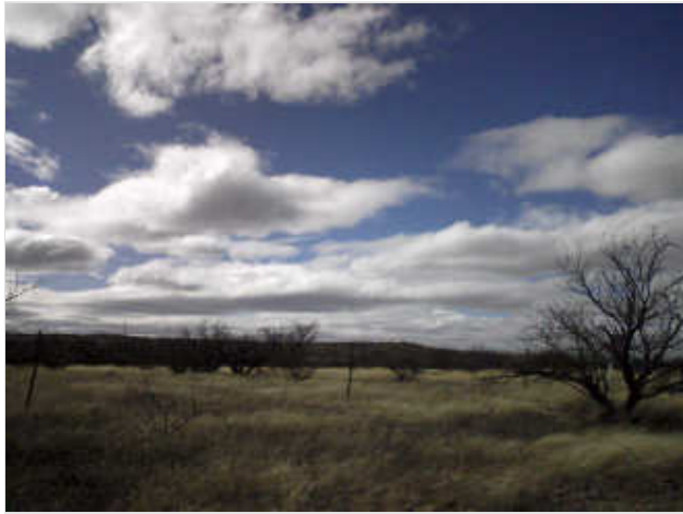
Pasture & frontage