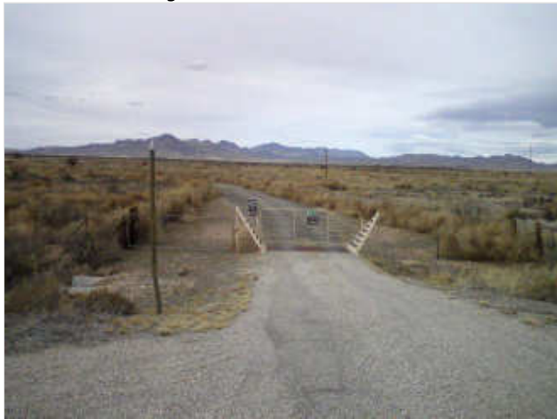
Ranch Entrance off of I-10